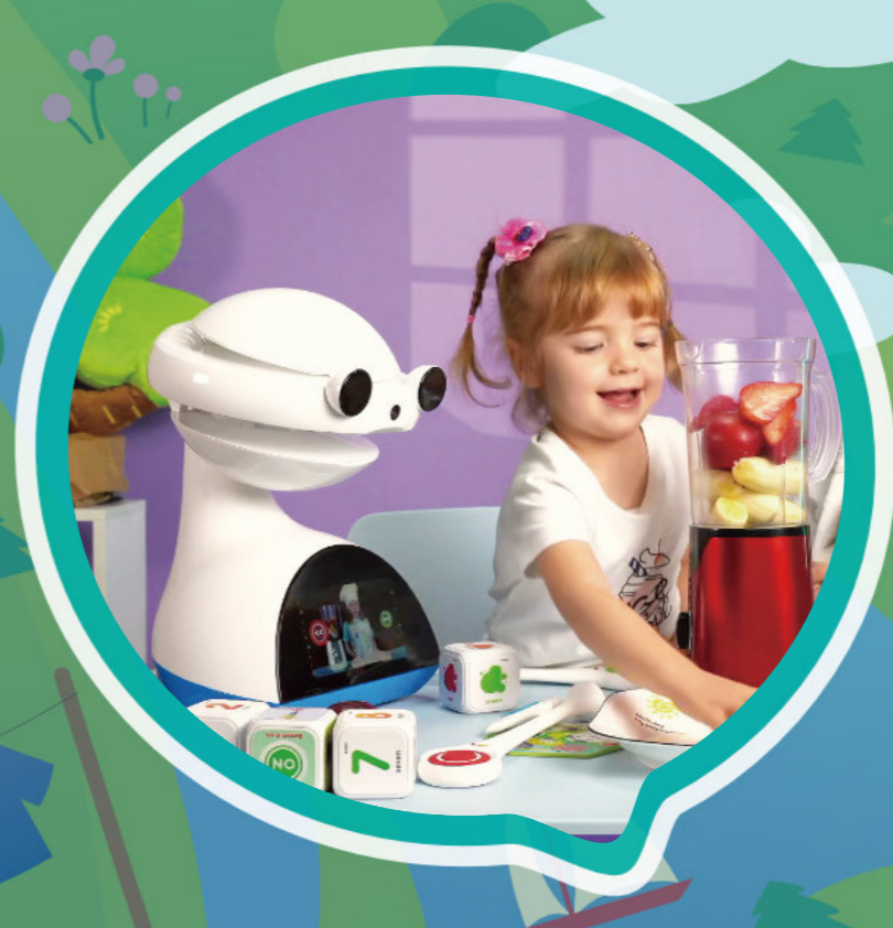
Put language in context