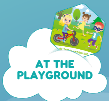
AT THE PLAYGROUND

Action-based learning helps children assimilate the language. EMYS' learning sets bring the physical world to the digital dimension. Each set is composed of colourful, tangible, and theme-based smart toys and smart tags that stimulate kids' senses for in-depth learning.