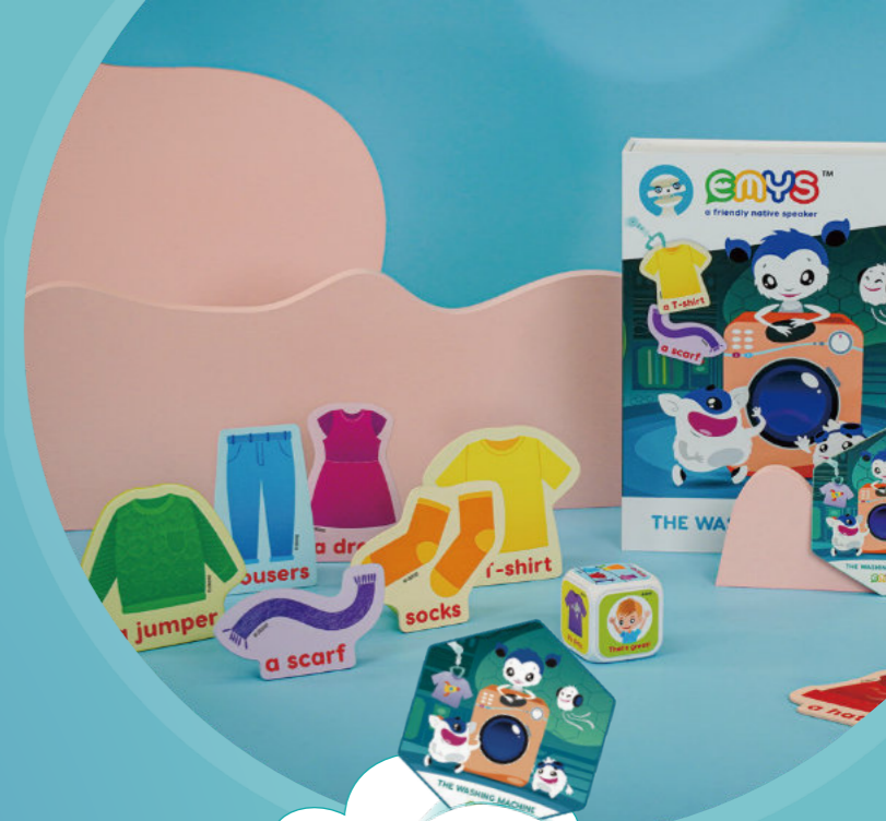
THE WASHING MACHINE