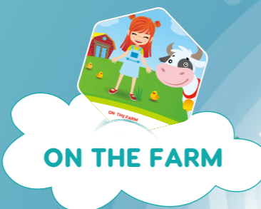
ON THE FARM