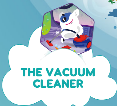
THE VACUUM CLEANER