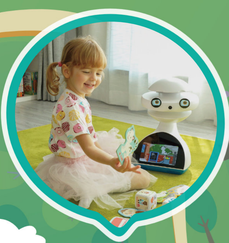
Learn new words