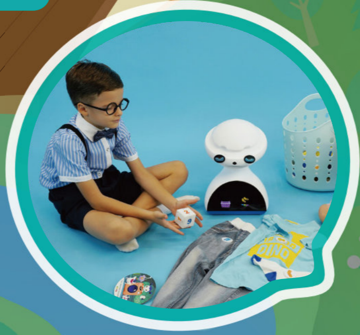
Playfully activate new skills