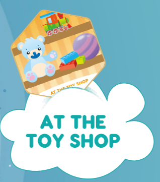
AT THE TOY SHOP