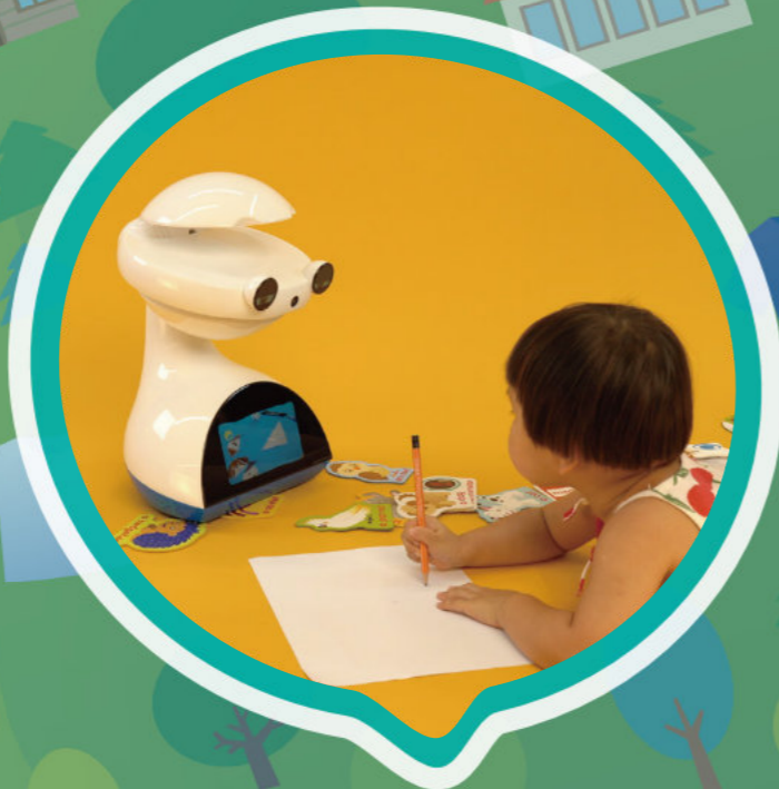
Create & Learn