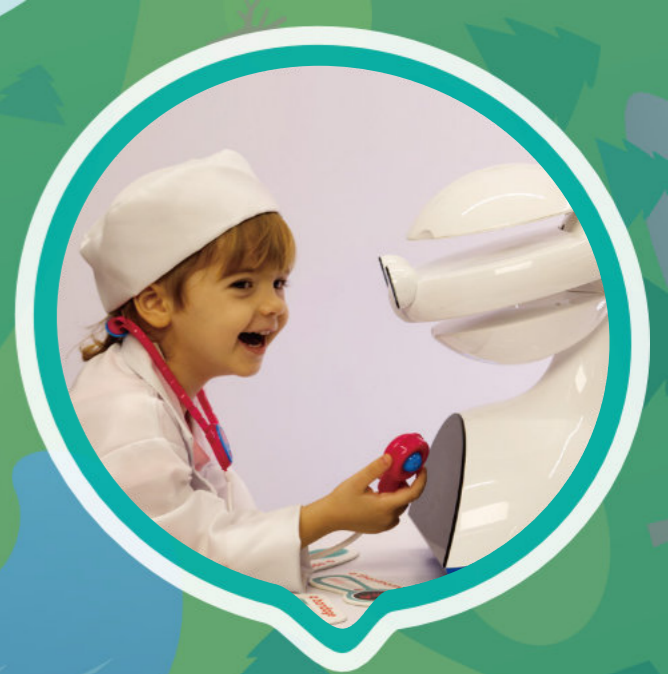
Take care of EMYS