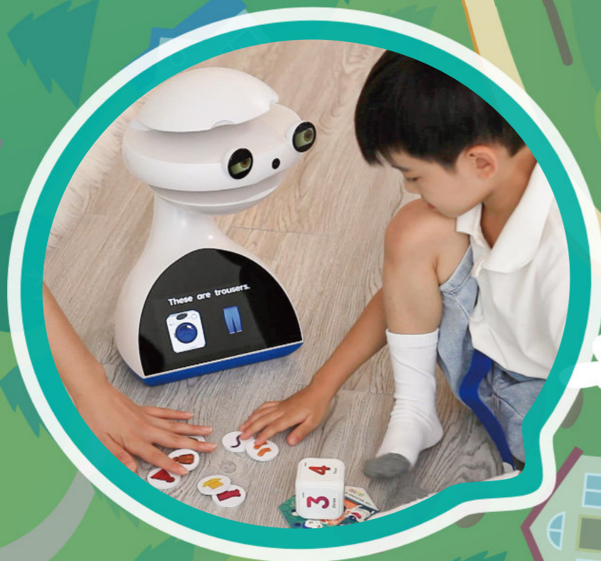
Speak in phrases