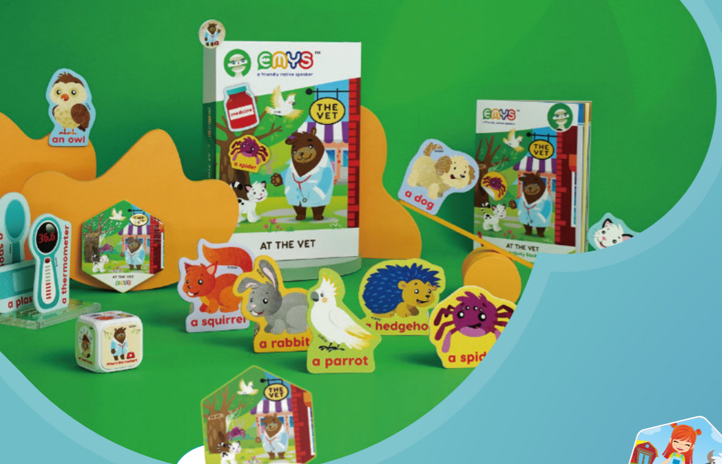
AT THE VET

Action-based learning helps children assimilate the language. EMYS' learning sets bring the physical world to the digital dimension. Each set is composed of colourful, tangible, and theme-based smart toys and smart tags that stimulate kids' senses for in-depth learning.